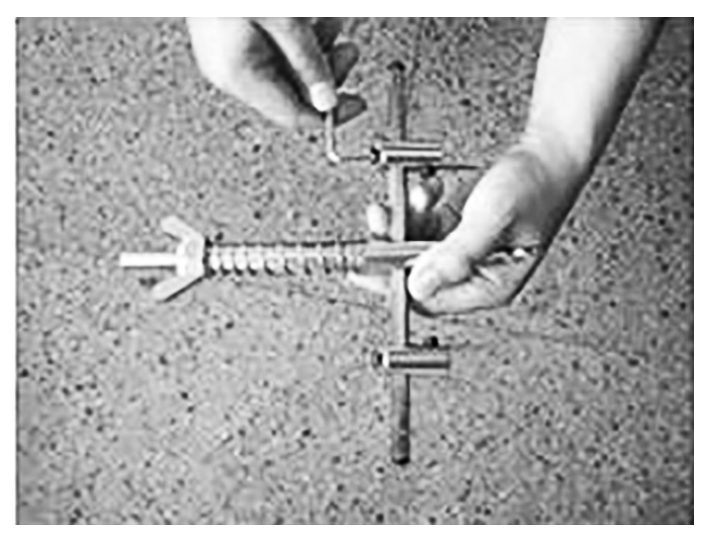
1. Adjust the distance between the two blades to match the required hole size to be cut.