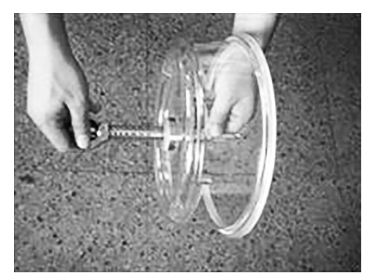
4. Replace and tighten the spring and nut.