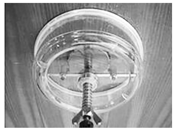
5. Cut hole by attaching a power drill to the top of the cutter.