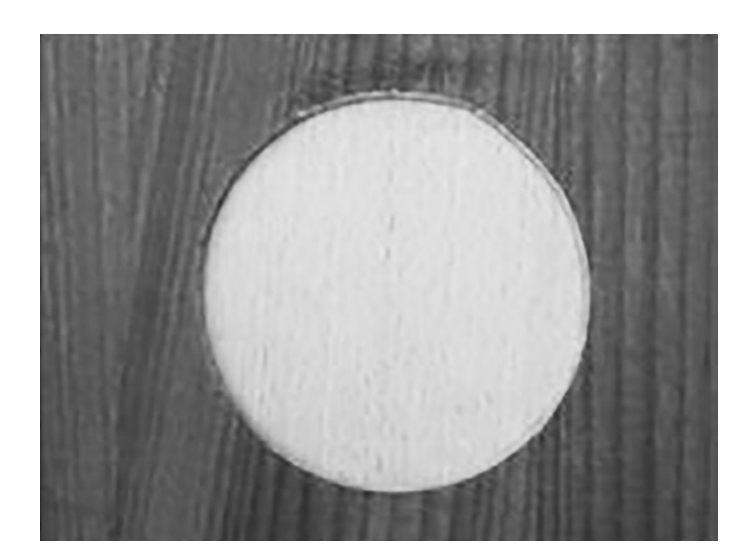
6. The hole after cutting.