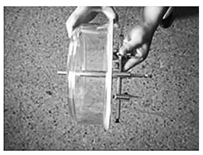
3. Insert the cutter into the transparent cover.