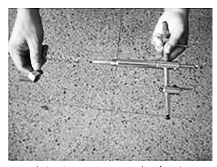
2. Unlock and remove the spring and nut from the hole cutter.