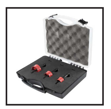
Includes 20mm holesaw, 25mm holesaw, 32mm holesaw, 3 x replacement springs, carry Case

Recommended For: Electrical Contractors, Gas Engineers and Installers