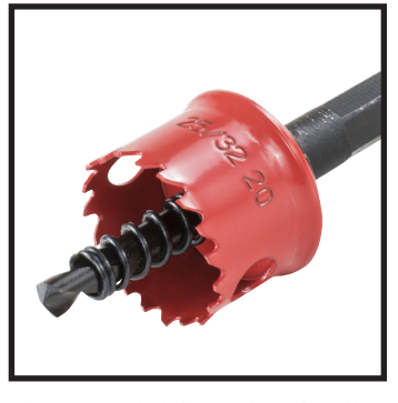
Also available individually