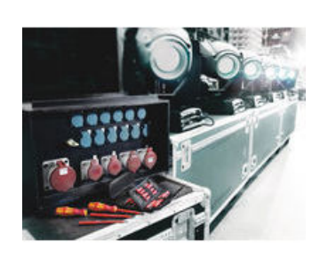
The tools can be stored and carried in a robust belt pouch, keeping them always to hand.