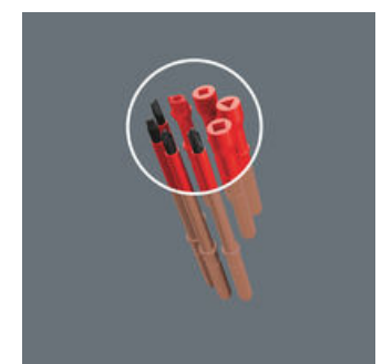
The system "one handle – many interchangeable blades" makes Kraftform Kompakt VDE compact screwdriving sets for in-house as well as mobile electrical applications out of the sets. The belt pouch is practical for tidy storage and transportation. Also available with electrical cabinet keys conforming to the industrial standards.