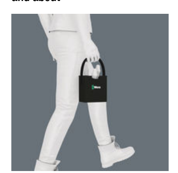
The large set-down area improves the stability of the Tool Quiver. Its large handle means that the guiver can be easily transported or simply hung up at the workplace.