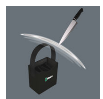
The robust and dimensionally stable material is very resistant against cuts and stabs. The tools carried are protected against damage and moisture. This enhances the service life of the tool box.