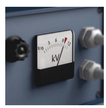
The individual testing at 10,000 volts, in accordance with IEC 60900, ensures safe working with loads up to 1,000 volts.

It happens time and time again that the tip slips out of the screw head when screwdriving, sometimes damaging valuable surfaces or even causing injury. The tips of the Wera Lasertip screwdrivers are microscopically roughened by means of a laser. This rough surface literally "bites" itself firmly into the screw head. Slipping out becomes a thing of the past.