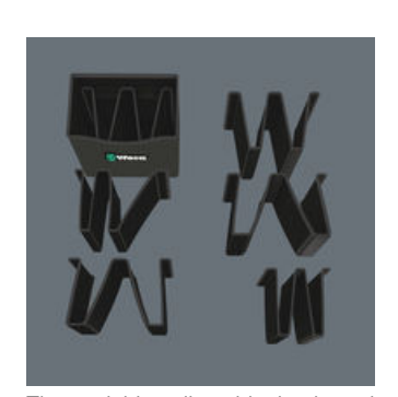
The variably adjustable hook and loop fastener partition in the Tool Quiver ensures neat and tidy arrangement of the tools.

https://products.wera.de/en/vde\_tools\_kraftform\_plus\_\_series\_100\_vde\_kraftform\_2go\_100.html Wera - Kraftform 2go 100 05004310001 -