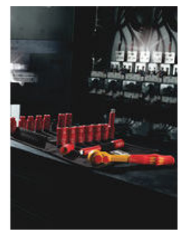
Zyklop VDE ratchet and accessories