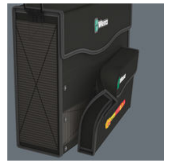
The textile box of the ratchet set 8100 SB VDE 1 is suitable for attachment to wall, shelf, workshop trolley and the Wera 2go system due to its back located hook and loop fastener strip.