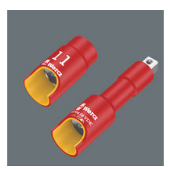
The Zyklop VDE sockets and extensions offer increased safety thanks to their 2-component isolation with yellow insulation core under red insulation outer layer.