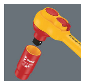
The ball lock ensures sockets and accessories are securely fitted, providing increased safety during operation. A short press on the release button allows the tool to be changed quickly.