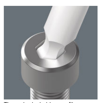
The spherical drive profile means that it is possible to swivel the axis of the tool to that of the screw, and therefore enable angled, "around-the-corner" screwdriving jobs.